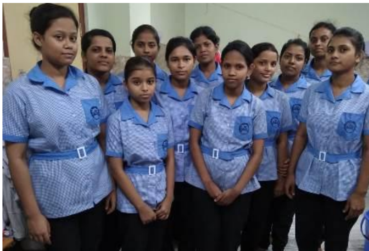
22 children cleared their Class 12 Senior Secondary Examination and joined college. 9 children have cleared their Class 10 Secondary Examination and started High School.

For the past few years we have had the opportunity of helping aspiring young students, both in urban and rural areas, to pursue their chosen professional courses to enable them to enter the work force on a firm footing.